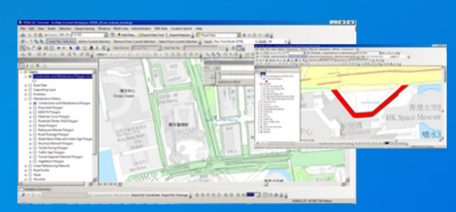
<u>Historical Records on Road</u> <u>Surface Reconstruction</u>

Data Conversion of Central Kowloon Route – Buildings, Electrical and Mechanical Works (HY/2019/13) for Road Data Maintenance System of Highways Department (Hong Kong, 2020)