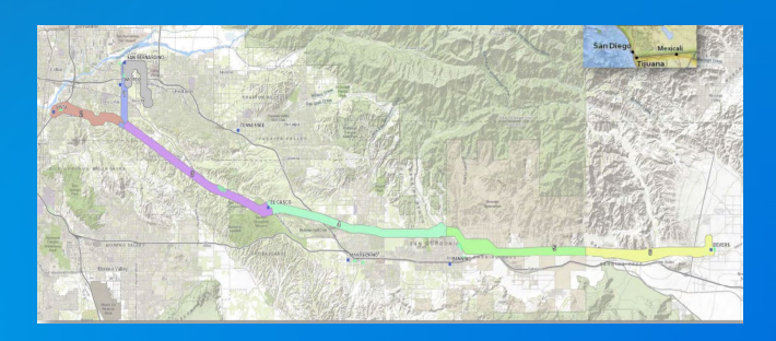
2D Map of Transmission Line