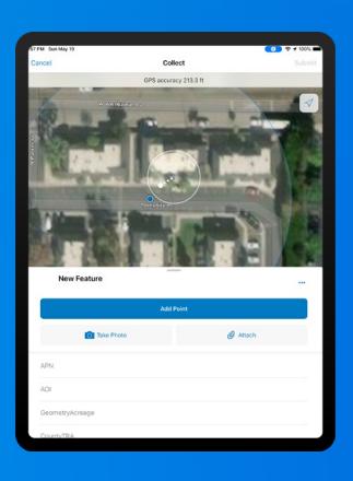
ArcGIS Field Applications