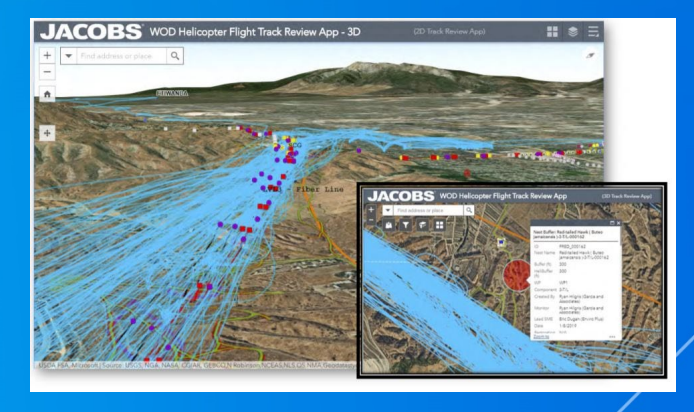
3D Helicopter Flight Track Review App