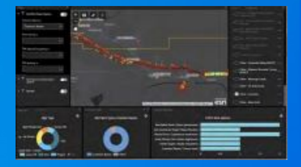
Safety Monitoring on ArcGIS Dashboard